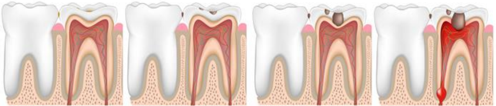
1. Healthy tooth